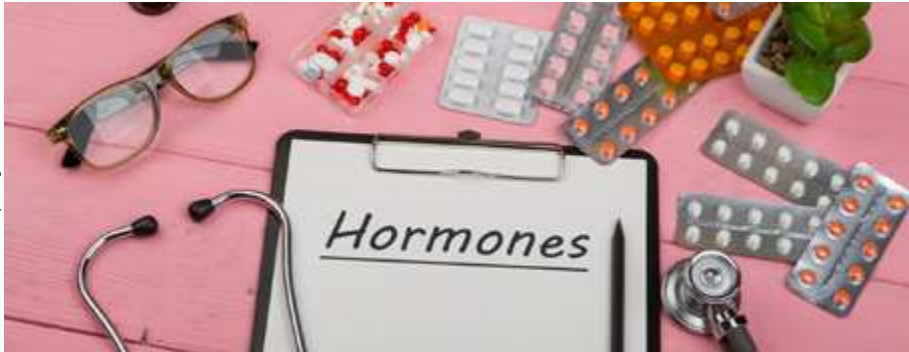
Table 1: Hormone therapy for hot flashes