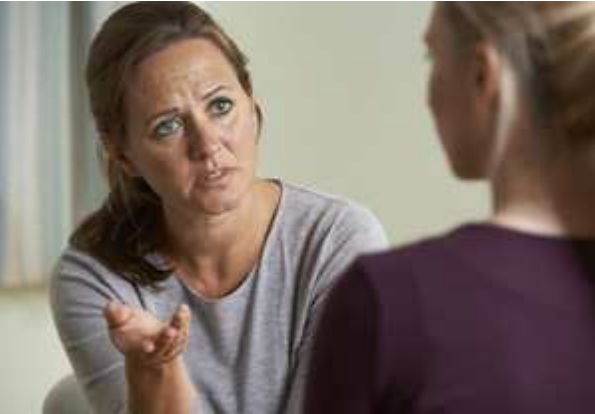
If you are having problems with anxiety or depression, psychotherapy may be helpful.

Psychodynamic therapy. Participating in this form of therapy helps you to recognize how your past relationships and experiences may be affecting the way you interact with people today. Then you learn ways to confront unresolved emotions and heal from past hurts so that you can be happier in the present.